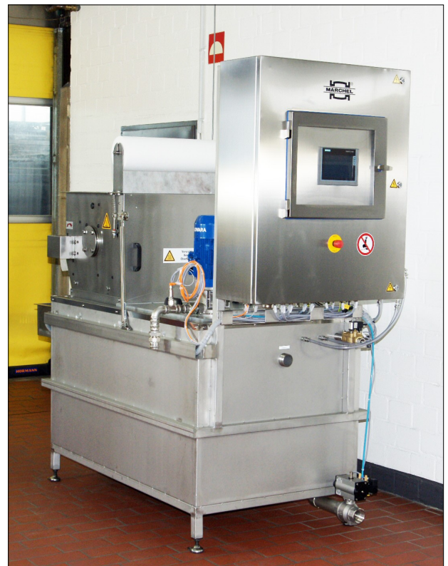
Filtering and control unit with capacity of 550 liters